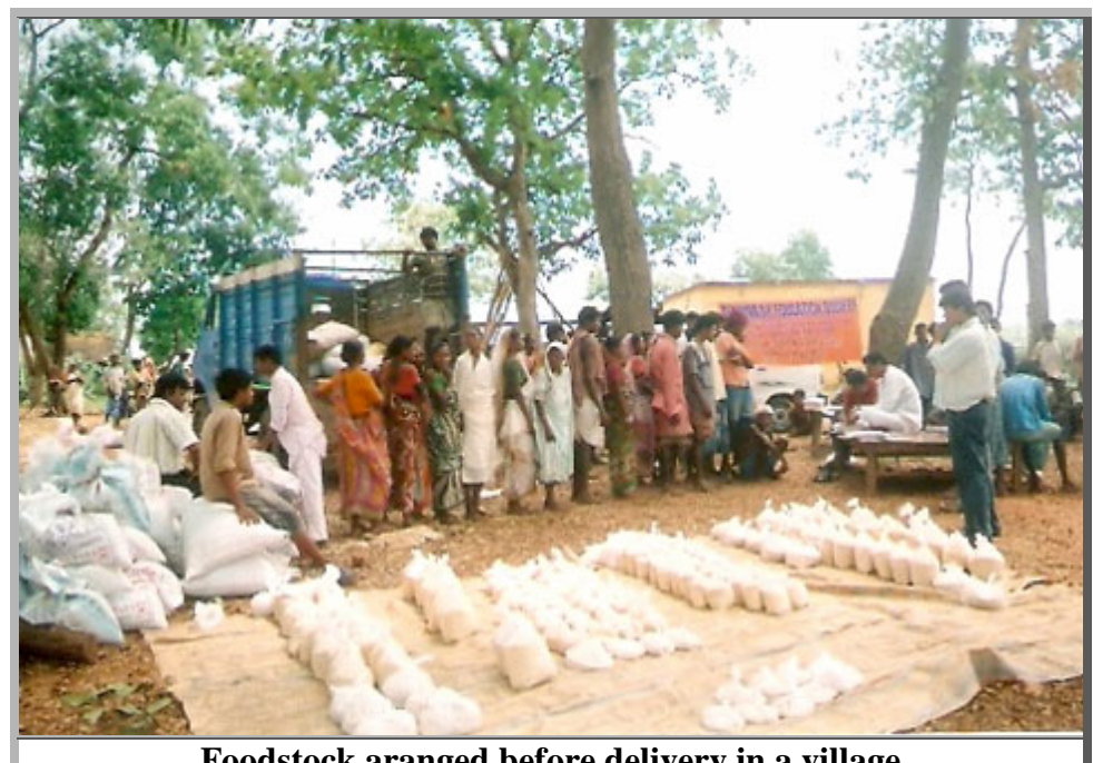
Foodstock aranged before delivery in a village