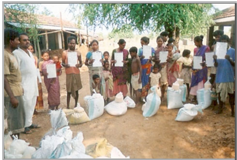
Villagers with their respective Foodstock and with their Parivaar Foodstock card at Tumankocha village in Jharkhand