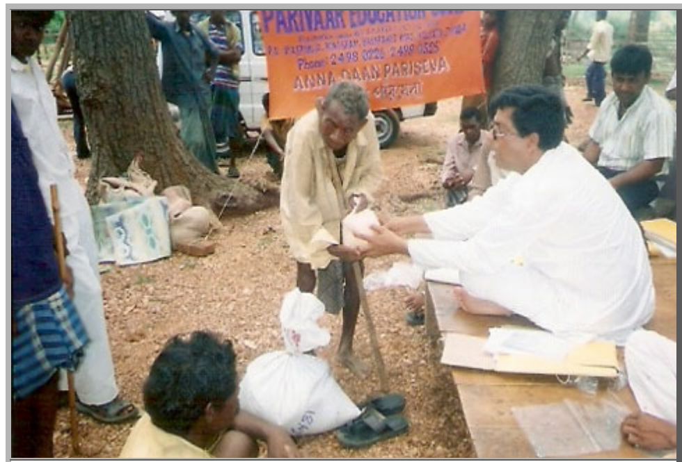
Villagers marking heir thumbprints on the Parivaar Foodstock Cards while receiving the foodstock.