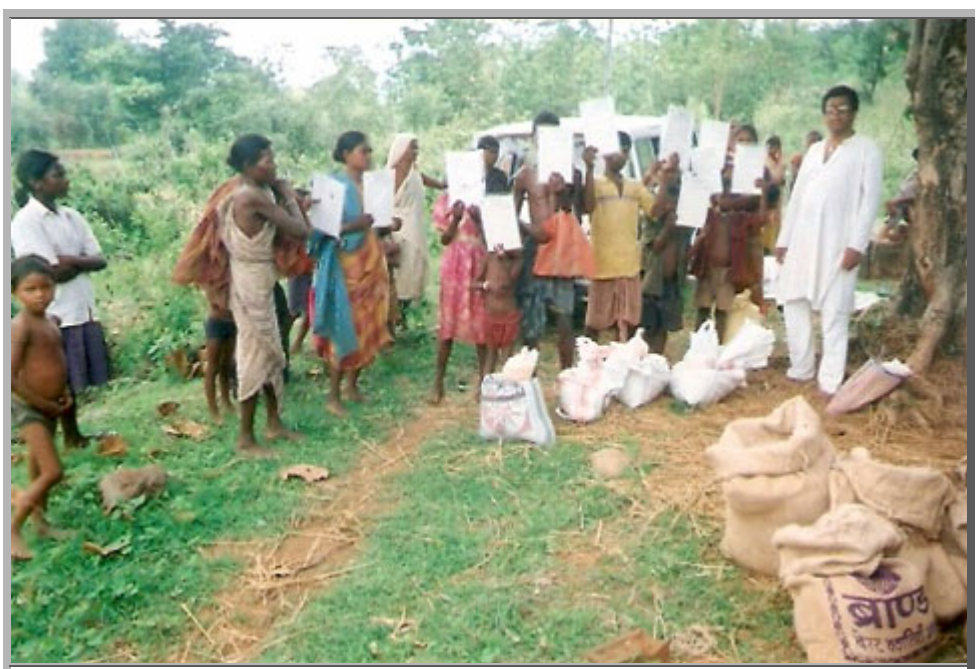
Vinayakda and Pulakda with villagers in Tumankocha and Chhatradanga respectively in Jharkhand