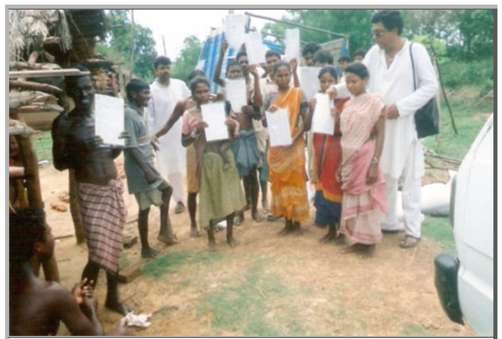
Pulakda with villagers with their Parivaar Foodstock cards at Amlasole in Belpahari block.