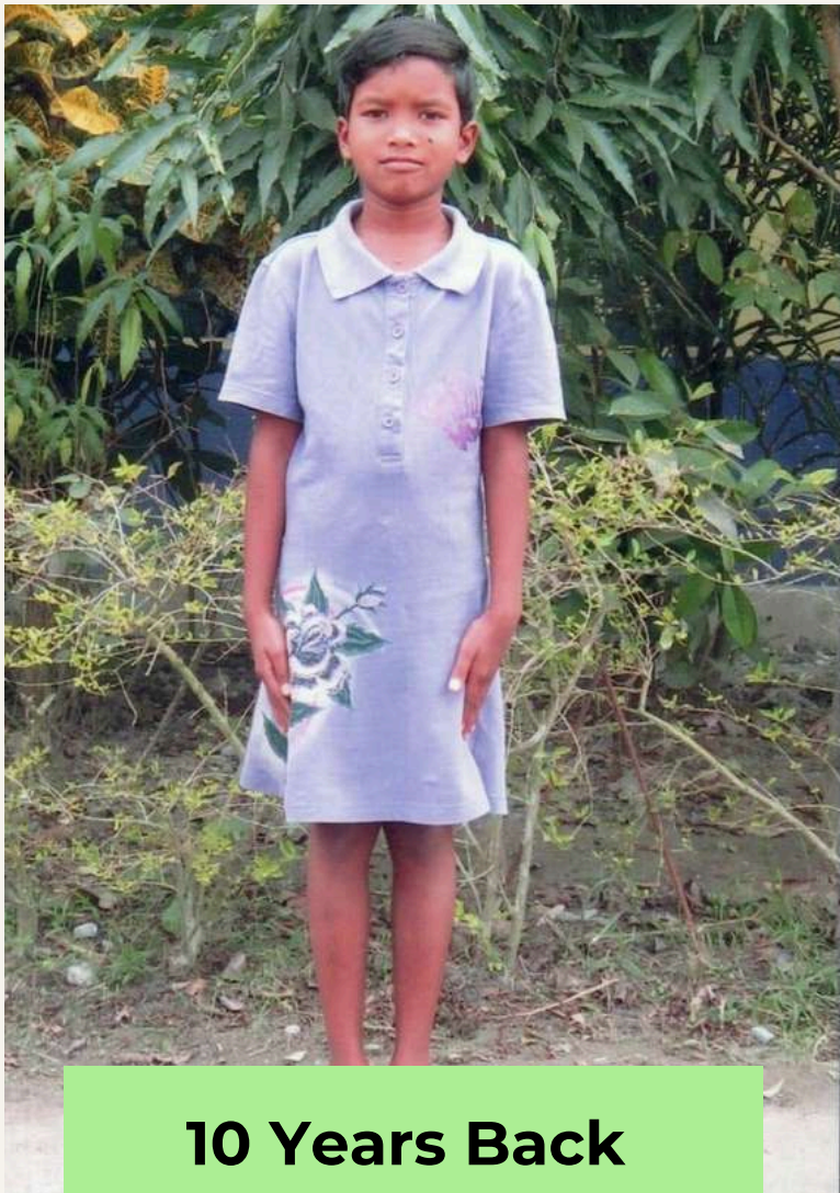
10 Years Back

She is inclined towards studying commerce and economics and aims to become a Chartered Accountant. Parivaar will fully enable her in the pursuit of her dreams.