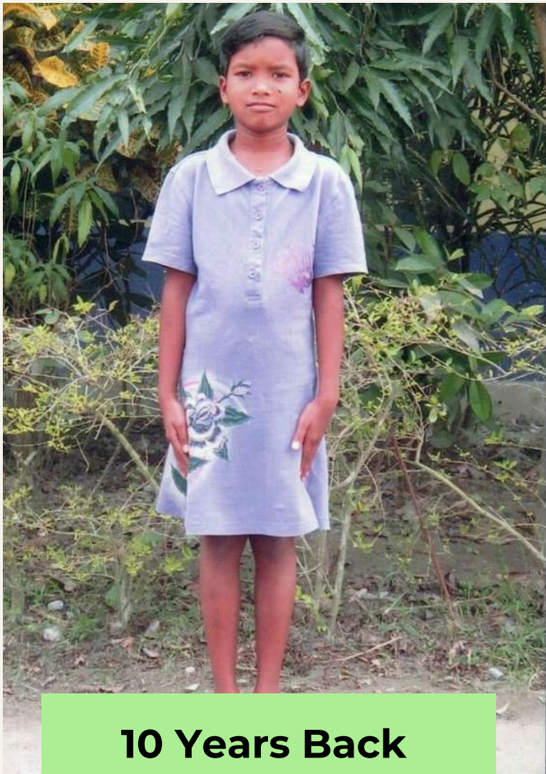
10 Years Back

She is inclined towards studying commerce and economics and aims to become a Chartered Accountant. Parivaar will fully enable her in the pursuit of her dreams.